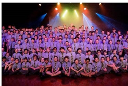
Year 7 Massed Choir