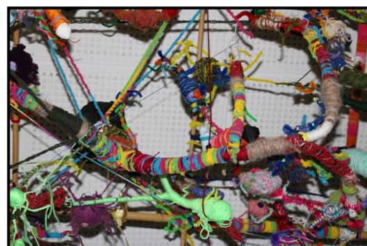
2M contributed the most class Neurons