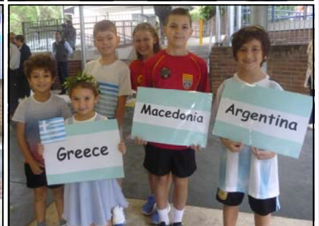
Harmony Day smiles!