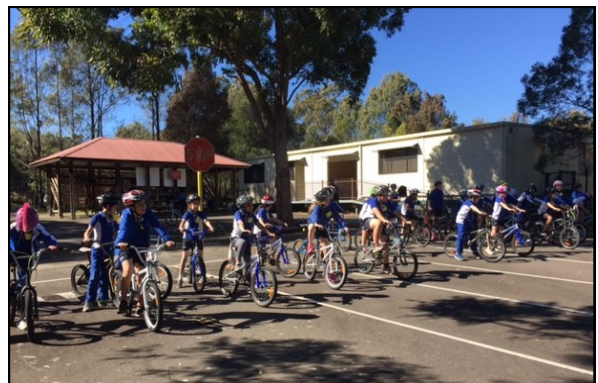
Students from Years 5& 6 spent time learning about road rules and bike safety at CARES last week.