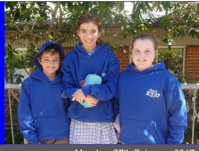
Monday, 27th February 2017