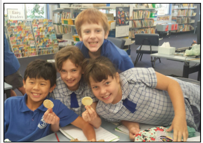
Science lessons are fun at Truscott Street.