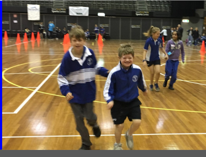
Monday, 22nd August 2016