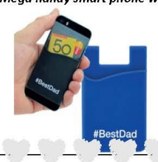
Item 9: Mega handy smart phone wallet!