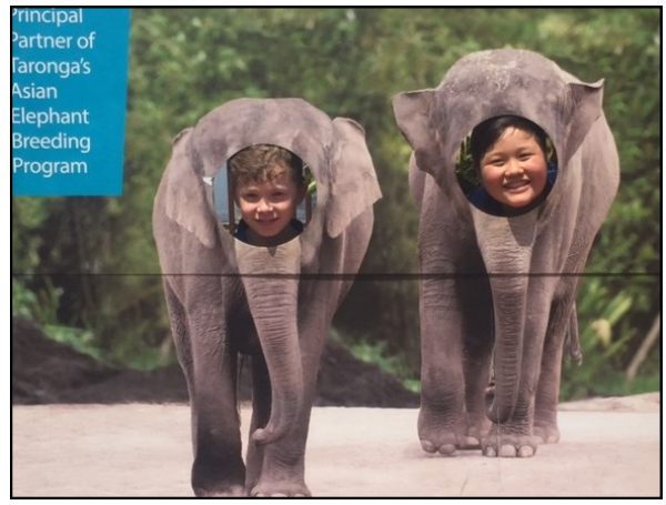
Fun times on the excursion to the zoo last Monday.